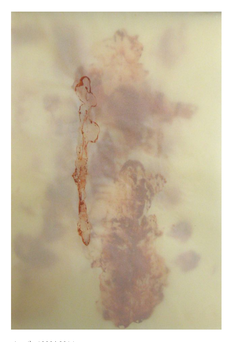
W.T. (Human and owl), 1999/2014, Raw Siena on transparent paper, 3 papers, layered, 40 x 30 cm