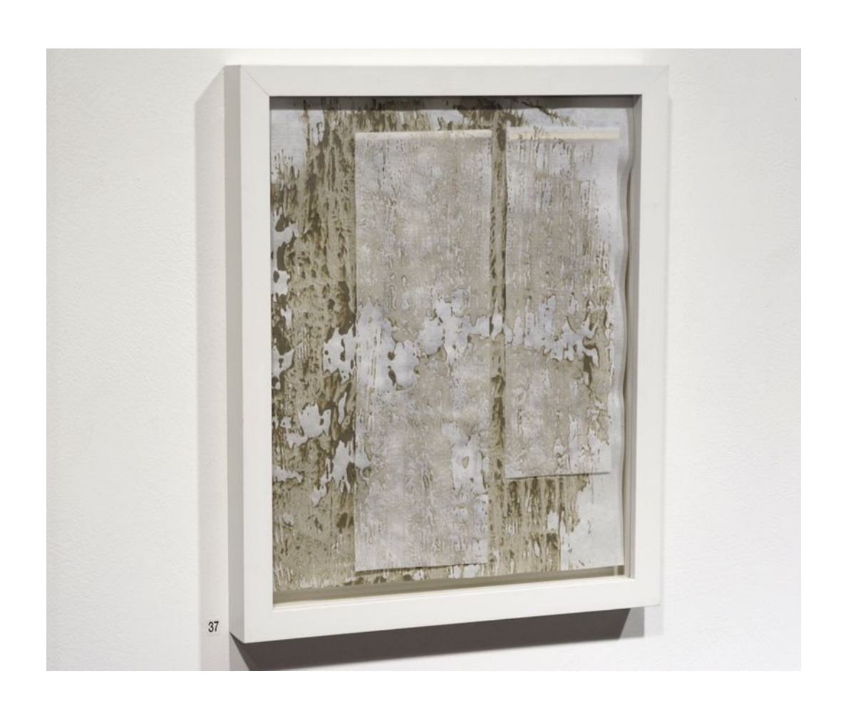
W.T., 2014 Oil Shale on Japanese tissue paper, layered, 29 x 22 cm