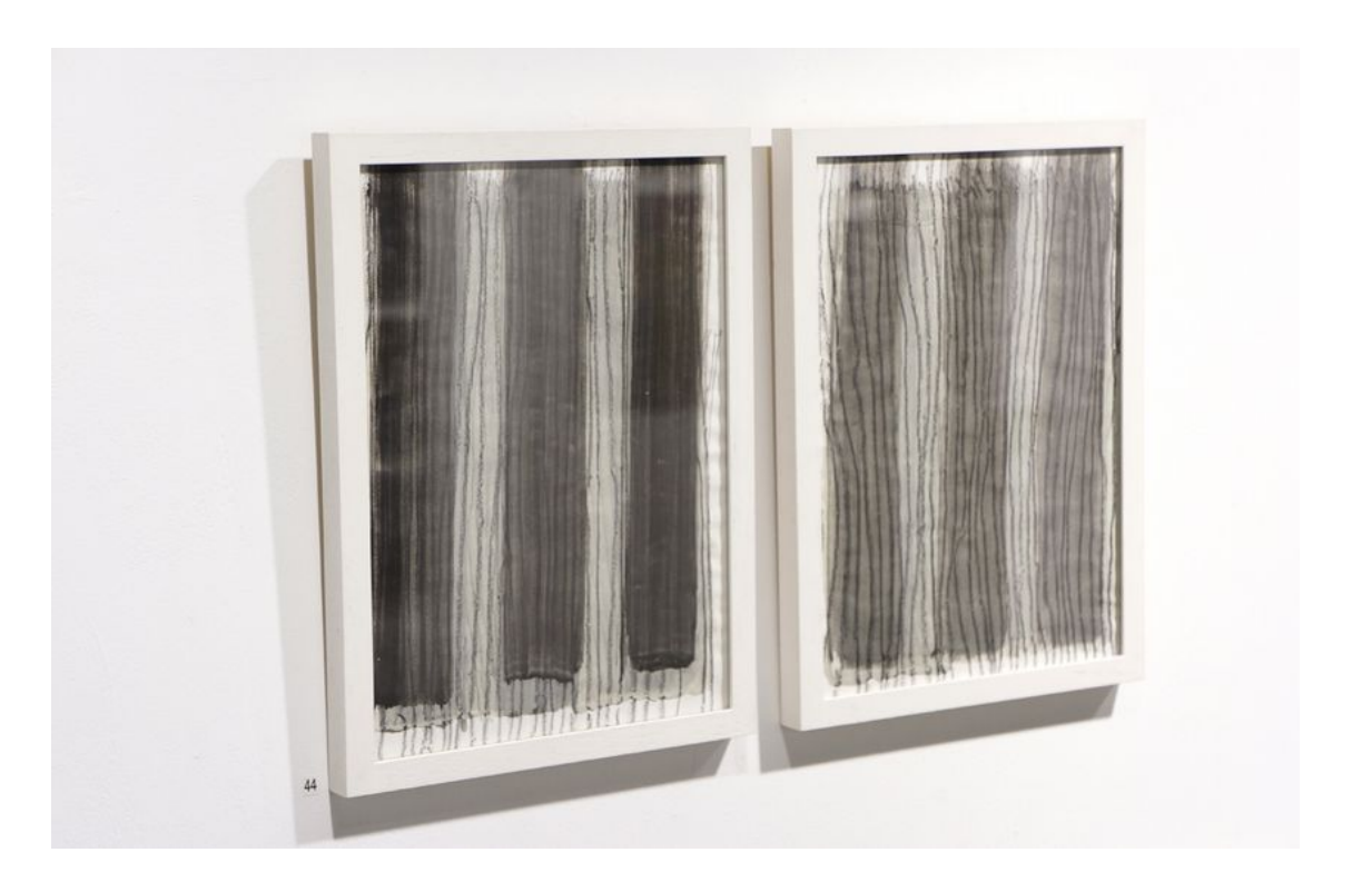
W.T., #3, # 4 (# 5, #6, #7, #8), 2015 Bideford black and stone pigment on paper, 32 x 23 cm

For the exhibition at Naked Eye Gallery I've shown new work created with earth and stone pigments. I use a pigment called Bideford black from North-Devon, England, a black coal, combined with a grey stone pigment from Germany, the title is Lines 2. There are also drawings on paper of the same kind. Another work is Global Codes with 10 different pigments, referring to a modern 4-D code, which gives virtual information. Some of the works on paper are drawings with charcoal, graphite and red chalk connected with red and yellow ochre. "Formationen" is an older work, oil shale with linseed oil on paper creating transparency and still appearing substantial.