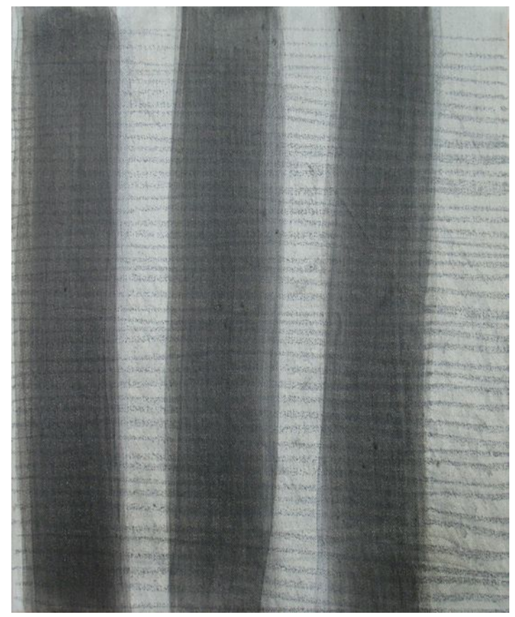
Line 3, 2015 Bideford black and stone pigment "Schiefer hellst." on canvas, 30 \times 25 \text{ cm}