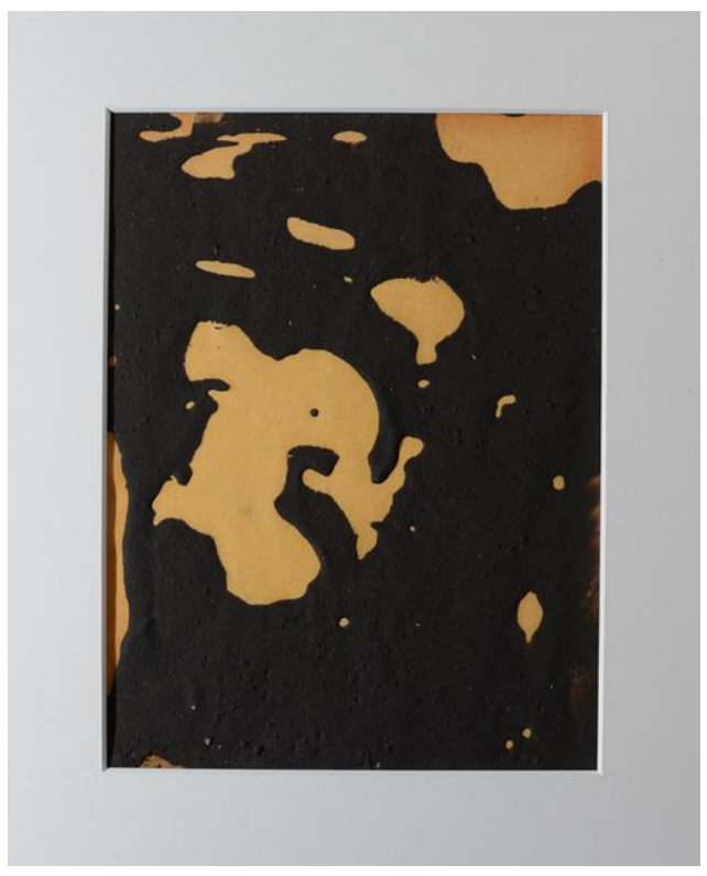
Formationen, 2001 Oil shale and linseed oil on paper, 21 x 15 cm