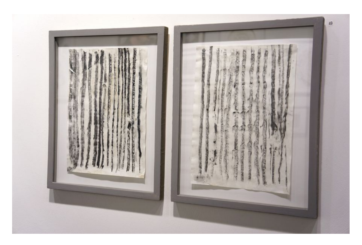
W.T., 2012 Drawing. Coal on paper, treated with water, 2 pieces, each 21 x 29 cm